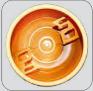
2 WELDED MIXING BLADES