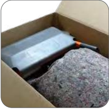
In Box Assembled Concrete Mixer