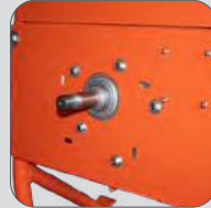
DRUM ROTATION WITHOUT GEAR RING