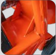
REINFORCED STRUCTURE, DRUM AND OPENING