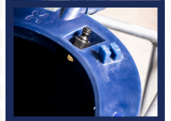
6. Hose Connector