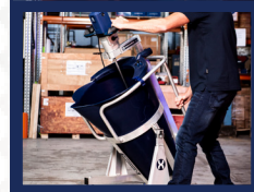
5. Easy tilt operation for precision pouring