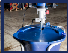
1. Removable dust splash and bucket