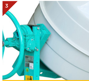
Gear box tilt system