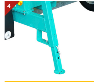
4x Stabilising Feet