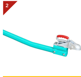
Dual coupling and removable draw bar - road towable to 90km/hr.