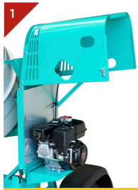
Engine and engine cover