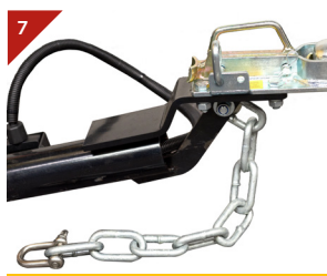
Safety Chain & plug Socket Standard