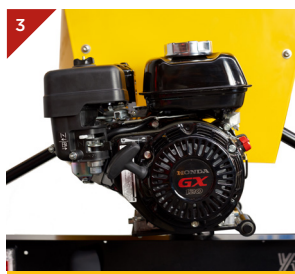
Honda GX120 Engine