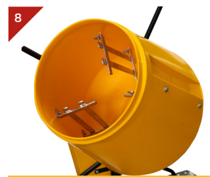
Polyethylene Bowl Option