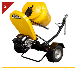
Rear Tip-Over Protection