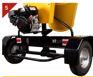
LED Lights & Number Plate Lights Standard