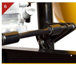
Simple Belt Tension System