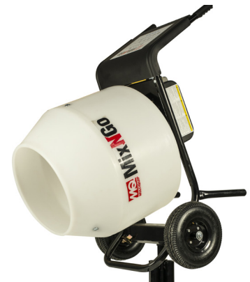
Mixer stand rotates 360°