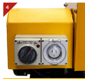
Or Electric Option 240V Single Phase